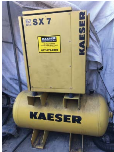
right: Kaeser model SX7 Rotary air compressor with air dryer; Robinair Cool Tech 34788 AC recycler; Hoffman wheel balancer and tire changer