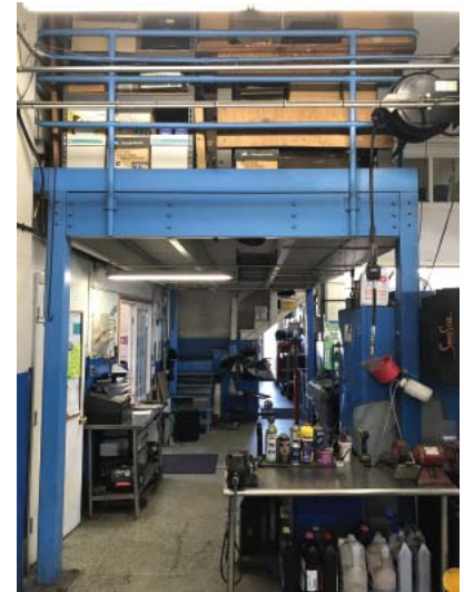
above: Rotary 7,000lb. capacity twin post hoist (1 of 3); Vetronix Mastertech service bay work station; 4-post steel mezzanine 8' 9" x 17' 5"