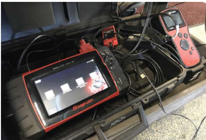
above: Custom granite top service write-up counter; EMC transmission case parts washer; Procut PFM 9.0 on car brake lathe; Snap-On D-TAC Elite battery analyzer