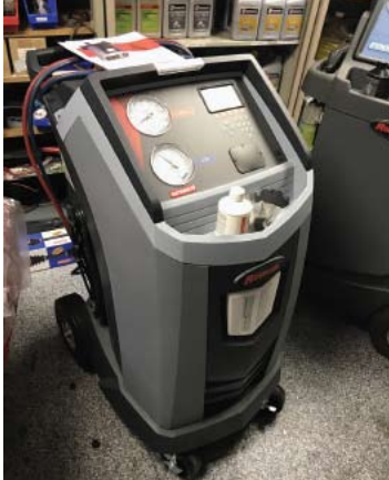
Robinair model 34788NI-H AC Recycler

330 South Claremont St. San Mateo, CA 94401 Sat., August 26 at 11am Preview 9am day of sale