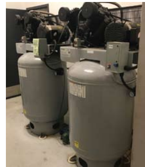
photos: Assorted Western All Tool twin post hoists; Hunter PA100 alignment analyzer with Western All Tool 12K Lb. capacity 4-post alignment rack; Partial view of office furnishings and machines; Hunter GSP 9700 Road Force Touch wheel balancer; Partial view diagnostic computers and scanners; Pro Cut PFM 9.2 DRO on car brake lathe; Partial view of customer lounge furnishings; (2) Bel Aire 10 hp. vertical air compressors