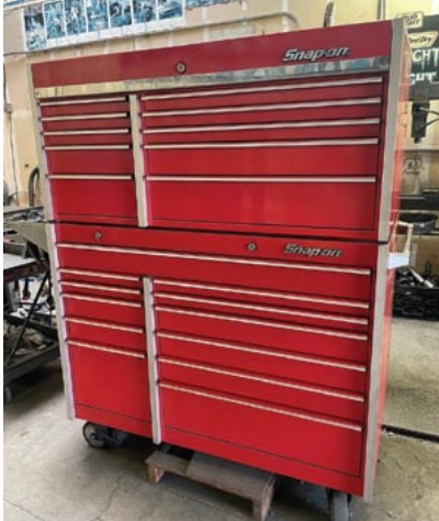
Snap-On rolling tool chest on chest

On-Site Preview Sat. June 23, 10am-3pm Location: 1820 Arnold Industrial Way, Concord, CA 94520 Auction begins 10am Tues. July 26, 2022 Bidding closes starting at 10am on Thursday, July 28