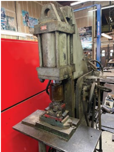
photos: Parker Hannifin punch press; Snap-On puller set with cabinet; Heavy duty shop press; Partial view Snap-On power tools; Miller Millermatic 250 welder