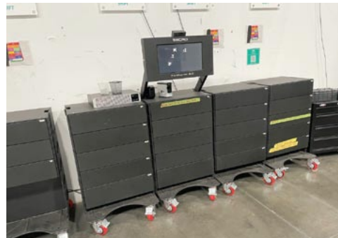
photos: Hunter BL500 brake lathe; Global floor scrubber with charger; Partial view bulk shelving and bottled automotive fluids; Kimball Midwest small parts cabinet with contents; Key Master 5.0 multi-cabinet key vault system

for information about sale items please call,